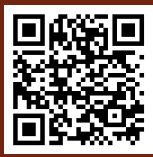
QR Code for Virtual Calendar